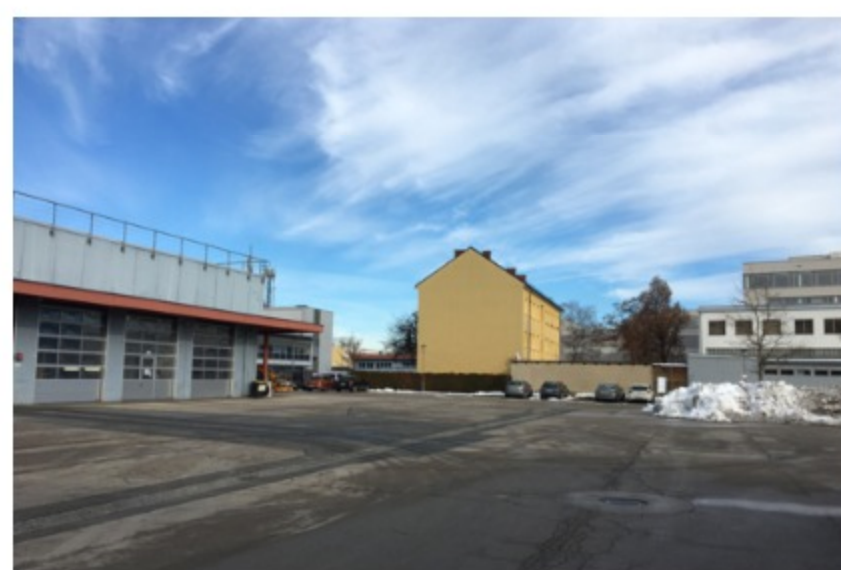
Remise South view toward East