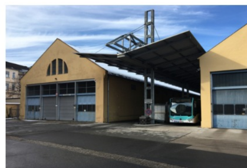
Remise South view towards North