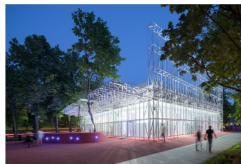
Nike Air Box in Gorky Park