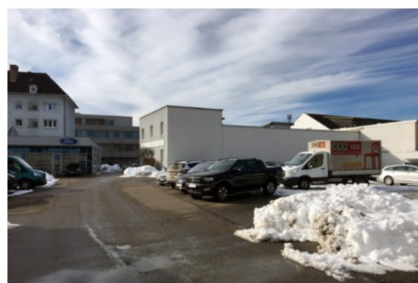
Corner Southwest view towards West

If we speak about metabolism, we perceive it in the sense that architecture should be quite a rigid, everlasting frame for ever-changing processes. We call this concept "hardware and software" in architecture. Therefore we speak about buildings' flexibility. Spaces and buildings should be flexibly adaptable in several time scales: daily – from one use/function in the daytime to the other in the night; yearly: with seasonal changes; and on a larger time scale: when instead of demolishing a building, it can be rather easily adapted to the new uses.