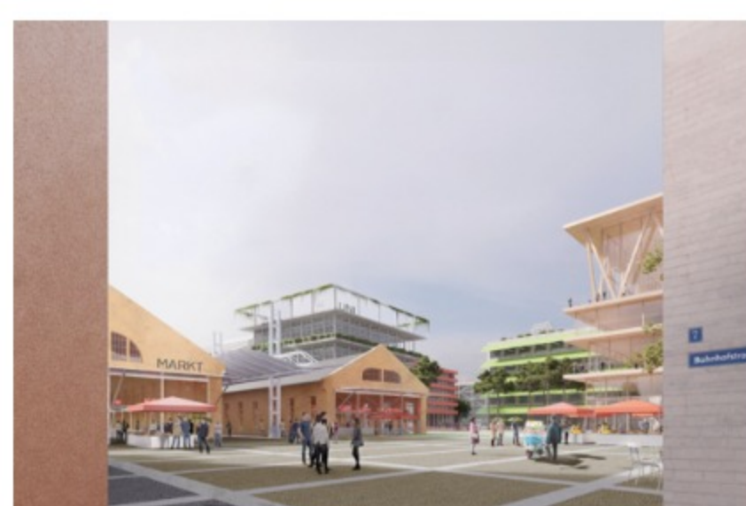
Enfilade of public squares: Market square, Cafe square and Event square

Architecture is not just a well-designed volume of a building, facade and internal layout. We believe that architecture is a spatial frame for spaces of public interaction, for being together. We believe that architecture should activate the space around and within it and provide extra quality to this space. That is exactly how we approached the Klagenfurt site of European 16. Instead of focusing on only architecture, we have proposed an enfilade of sequential public spaces/plazas which activate the whole site, let people interact and be together, and therefore, create a truly "Living City". These open spaces should be a frame or a background for people to spend their free time or work; play or study; relax or be active; meet each other or be with themselves. The projects of our office are quite diverse, but the topic of activating the public spaces and creating "spaces of being together" is common in most of them.