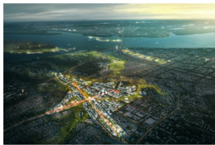
Saratov Masterplan 1st Prize in collaboration with KarresBrands Mandaworks