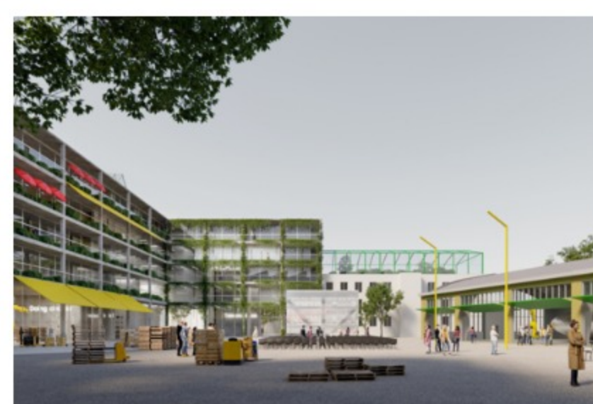
Markers square: production and presentation, culture and education, users and visitors of different categories can use the same multipurpose square