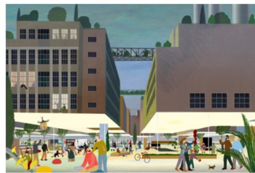
Klybeck Basel made for Kuehne Wicks